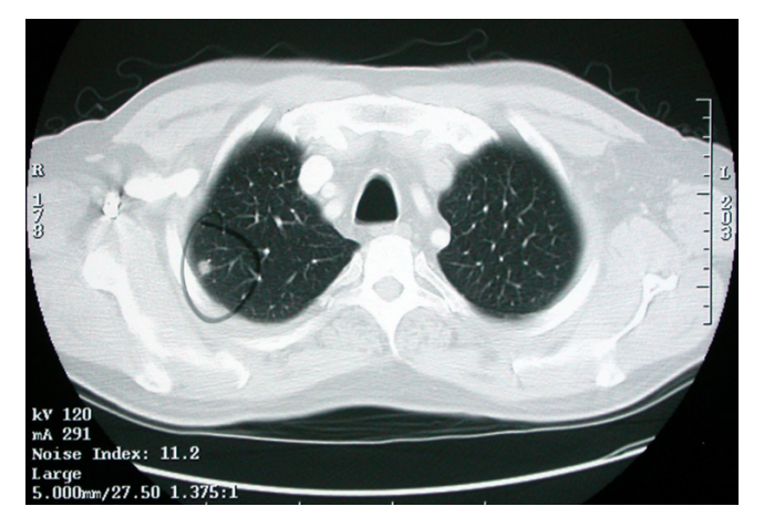
Figure I Chest CT scan showing a I cm right upper lobe nodule.

After three months, a follow up CT scan confirmed excision of the right lung nodule but demonstrated enlargement of the left sided lung nodule from 1.7 cm to 3 cm (Figure 2). Growth in a nodule with F-18 FDG uptake